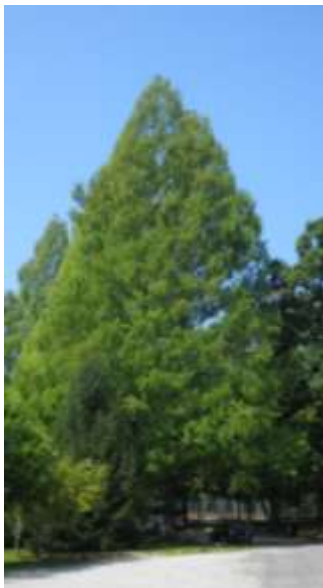
Dawn Redwoods in front of dining hall