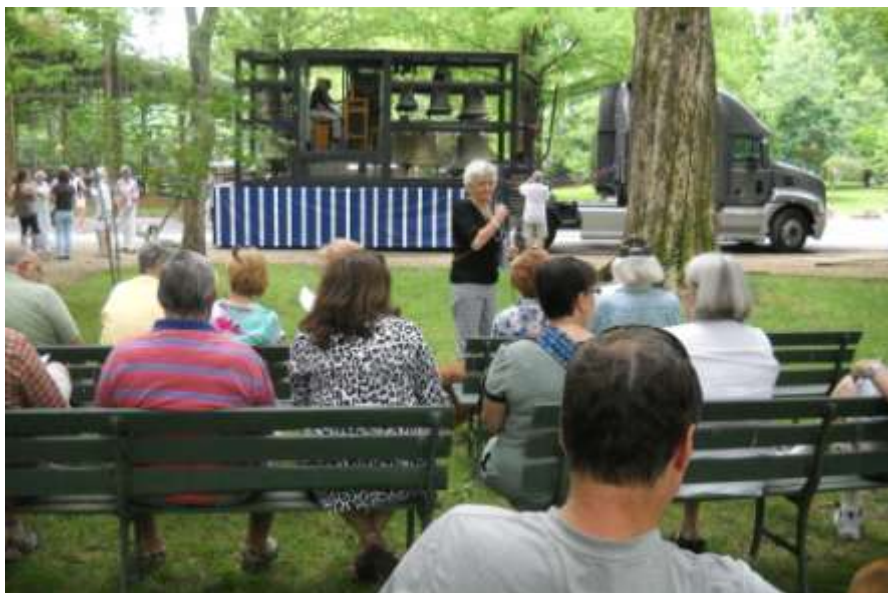
Carillon Concert on the mall.