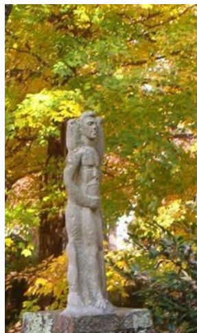
Do you know where this statue is located at MSSA?