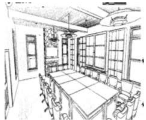
6 CONFERENCE ROOM PERSPECTIVE