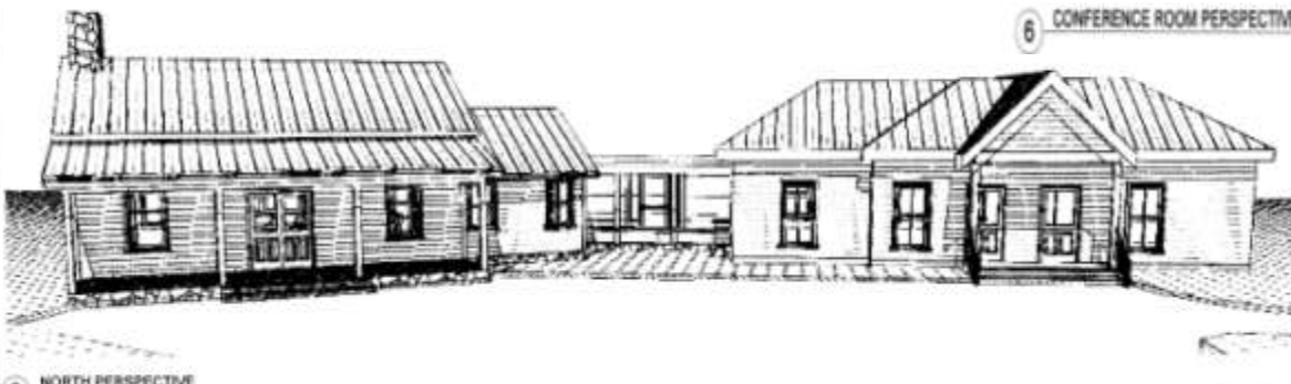
2 NORTH PERSPECTIVE