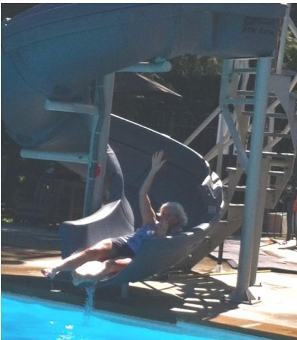
Kids of all ages love the new slide!