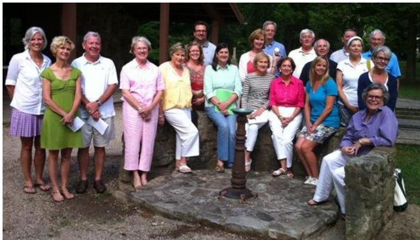
Last gathering of the 2012-2013 Board of Trustees